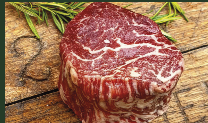
SOLOMILLO DE VACA 26€/ unidad