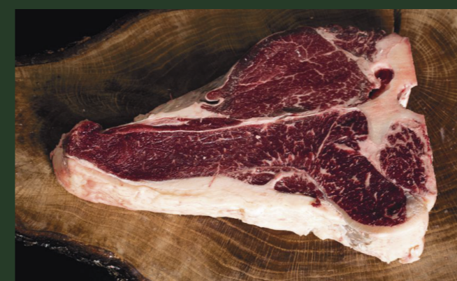
T-BONE DE VACA 75€/KILO

Cubierto por persona obligatorio (pan incluido) 1,30€. Table charge by person required (bread included) Contamos con carta de alérgenos a su disposición. Fotografías orientativas. IVA incluido. We have a letter of allergens at your disposal. Orientation photographs. VAT included.