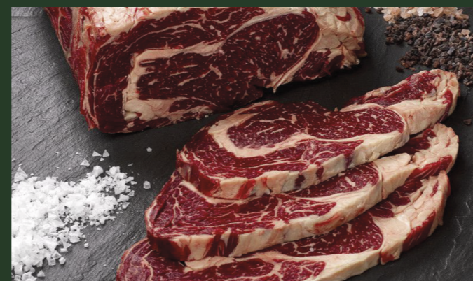
ENTRECOT DE VACA 24€/ unidad