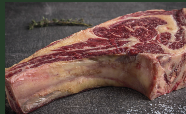
CHULETA DE VACA 75€/KILO